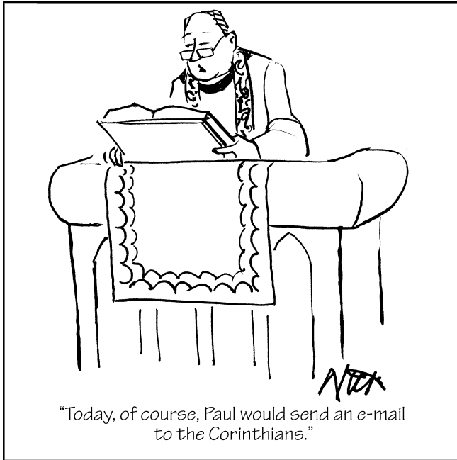
"Today, of course, Paul would send an e-mail to the Corinthians."