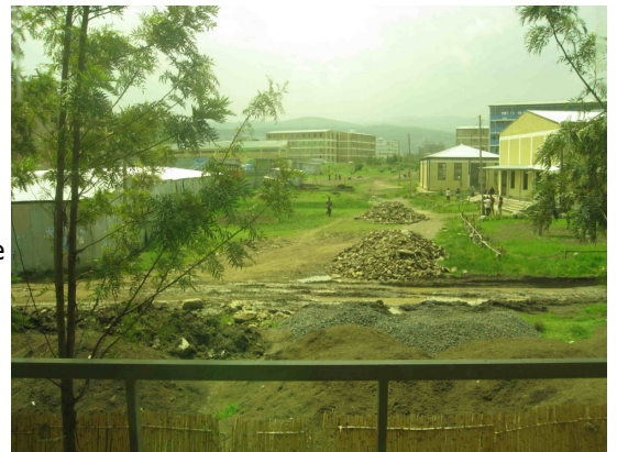
The view outside Elizabeth's window