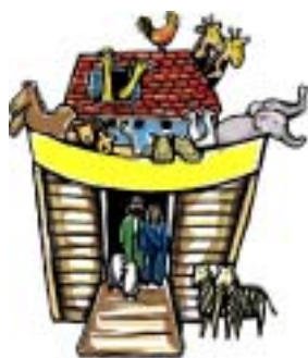
Noah's Ark Party

PRE-SCHOOLERS – Noah's Ark Party – Preschoolers ages 3-5 are invited to join us in room C309 for a morning of learning about the biblical story of Noah. There will be crafts, games, and snacks, along with singing! If you are planning to join us, be sure to ask mom or dad to sign up online at www.fbckomt.org by Thursday, July 30 th .