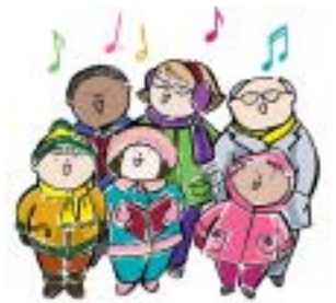
"Here we come a-caroling!"

Following the dinner on the 16 th , families and individuals are invited to form groups and embark on a joyous time of Christmas Caroling through the residential areas surrounding the church. You will be invited to stop at particular households where some of our church members reside, and offer them the gift of song.